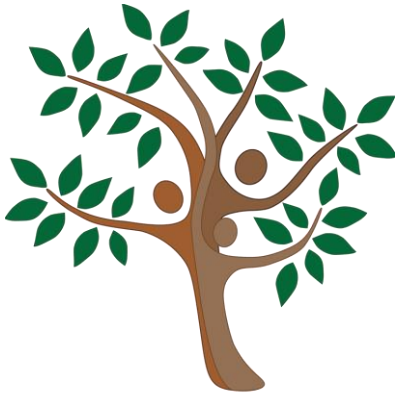
Trinity Village Family Council

The Family Council is a group of family members and friends of residents that meet on a regular basis. Our Council is an autonomous group which has been organized to improve the quality of life for residents and to give families a voice in decisions that affect them and their loved ones. We meet the second Tuesday of each month (January 8, 2019) in the Board Room in the Administrative wing at 6:15 P.M. Why not consider attending one of our meetings? We are always looking for people with varied life experiences and ideas to share with our group.